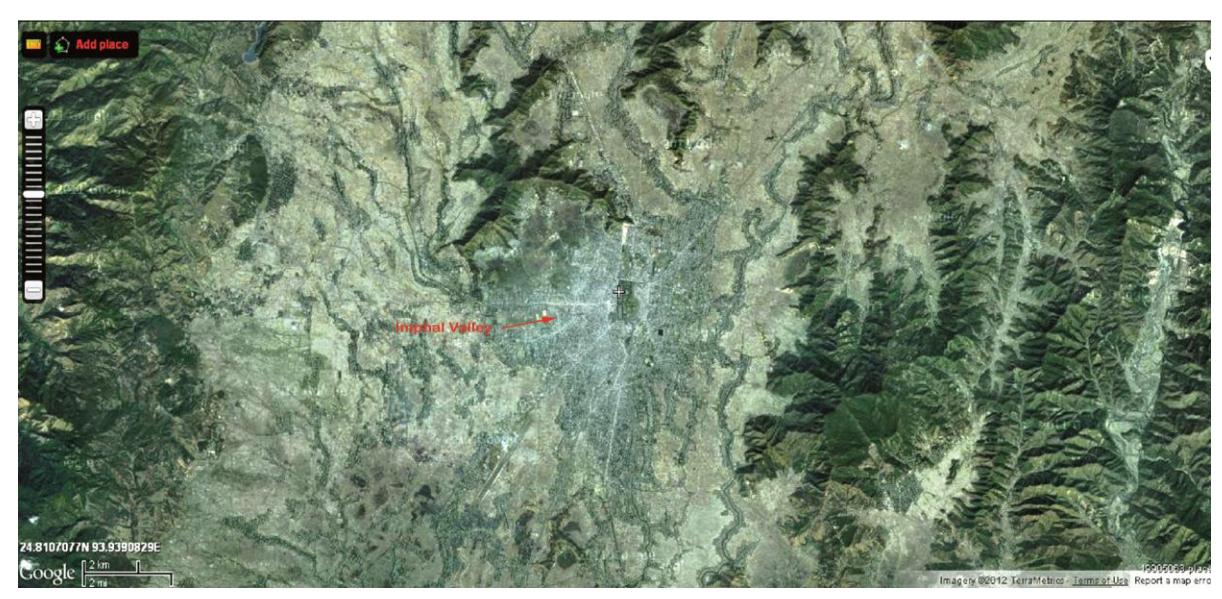
Figure 1. Imphal valley, Manipur (India), location site of the study.