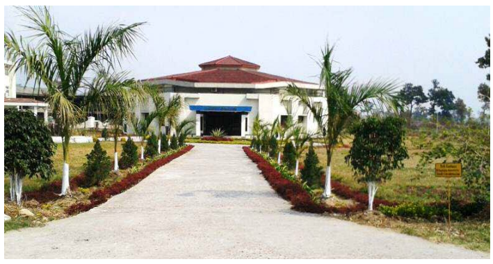
Auditorium, CHF, CAU, Pasighat