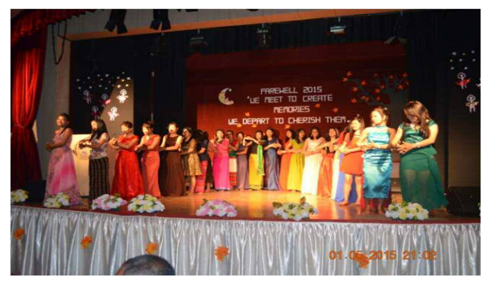
A scene of farewell function

A grandeur function was organized on 1st May, 2015